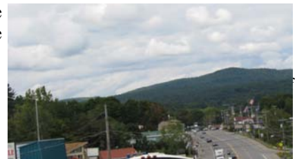
d g u v ö " g ũ V e j q s t " G z q f w u ö " c h v g i Lake George F.D. Boat Ride.