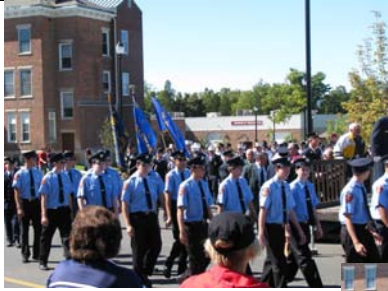
Long Island Day At the Home.