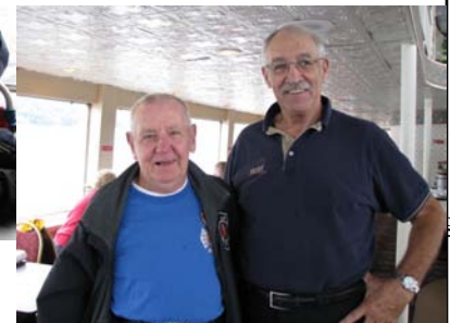
Abord the ship.