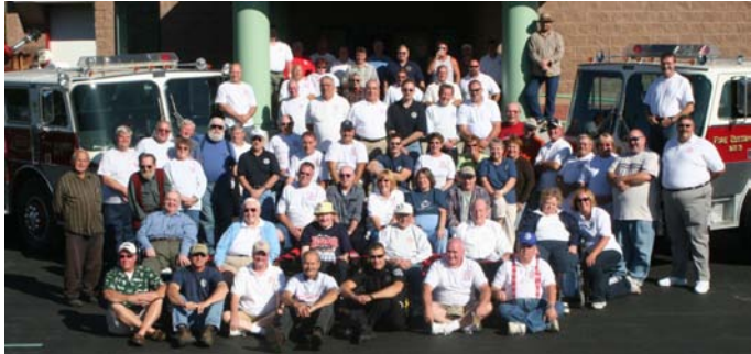
Life Members of the East Greenbush Fire Company pose for a group shot with the oldest pieces in the fleet, the 1987 Hahn pumper